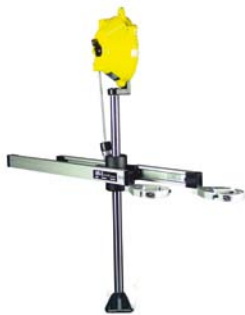
easy-linearfix-Twin for 2 screwdrivers