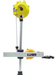
easy-linearfix-Tele pull-out relief arm