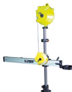
easy-linearfix-B with stops